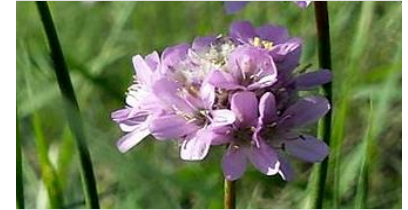
Armeria maritima ssp. halleri